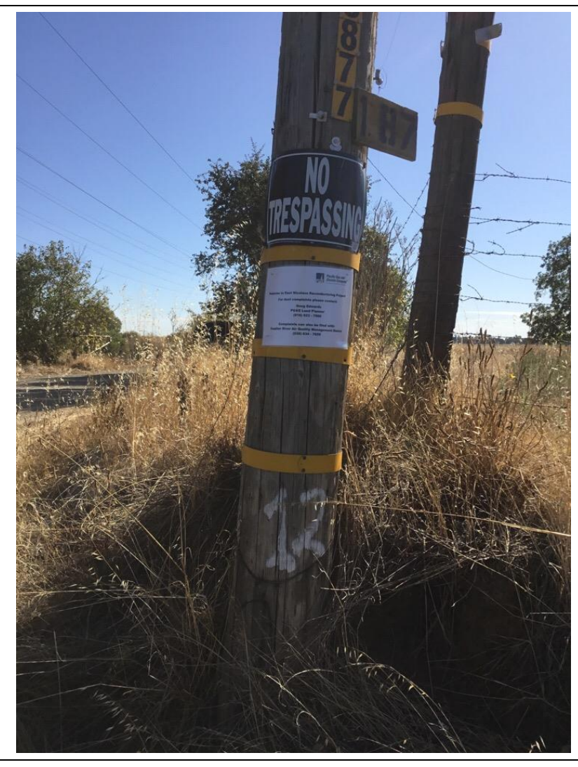
Photo 4: Signage installed to provide fugitive dust inquiry information to the public in accordance with APM AQ-2.