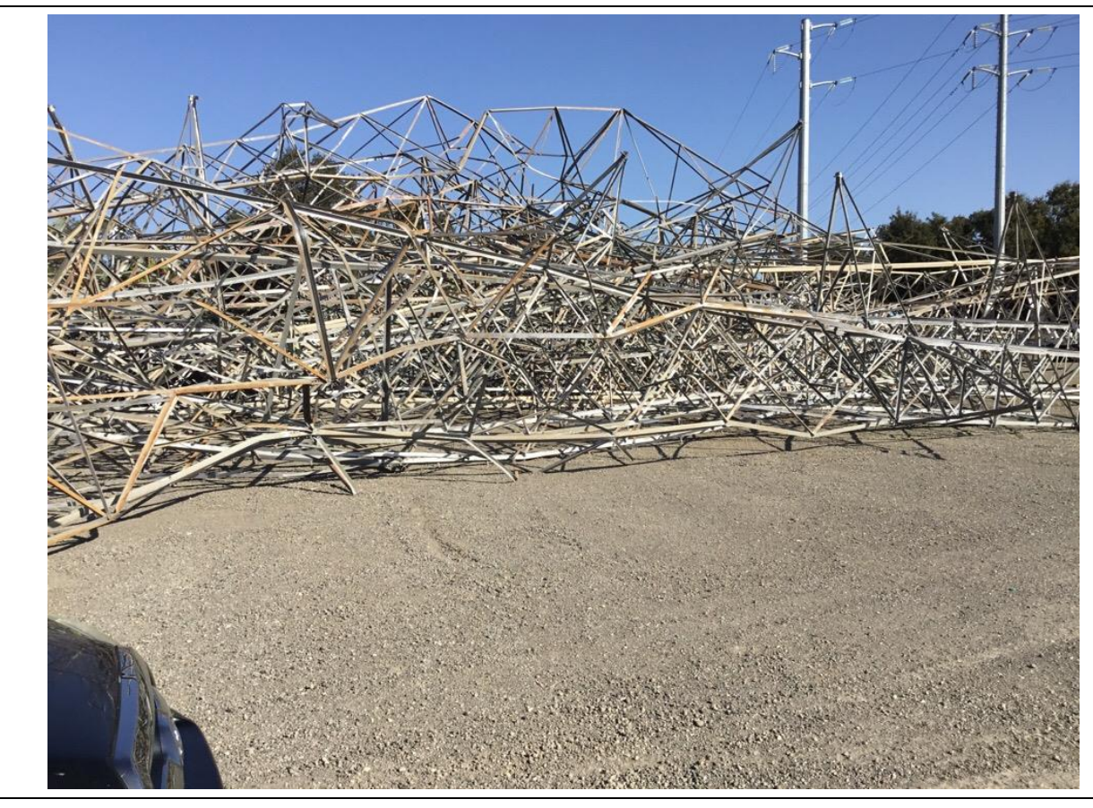
Photo 2: Removed tower structures are temporarily stored at LZ 4/31. The structures are planned for removal prior to the start of nesting bird season.